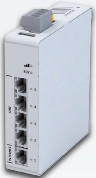
Remote elevator monitoring module