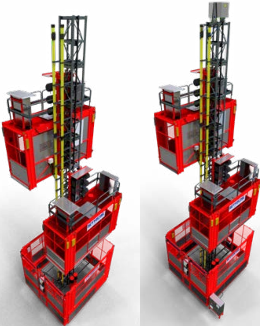
Bus bar heating